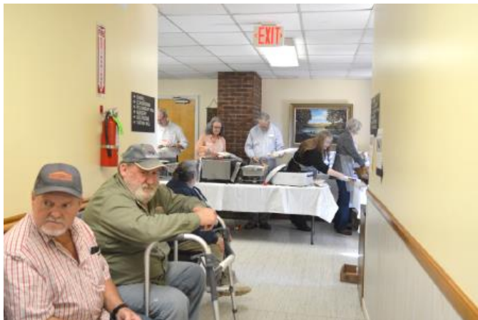
At the take out center a great meal was had by all