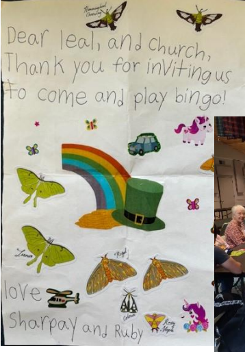
Bingo in Tartan Hall - April 11